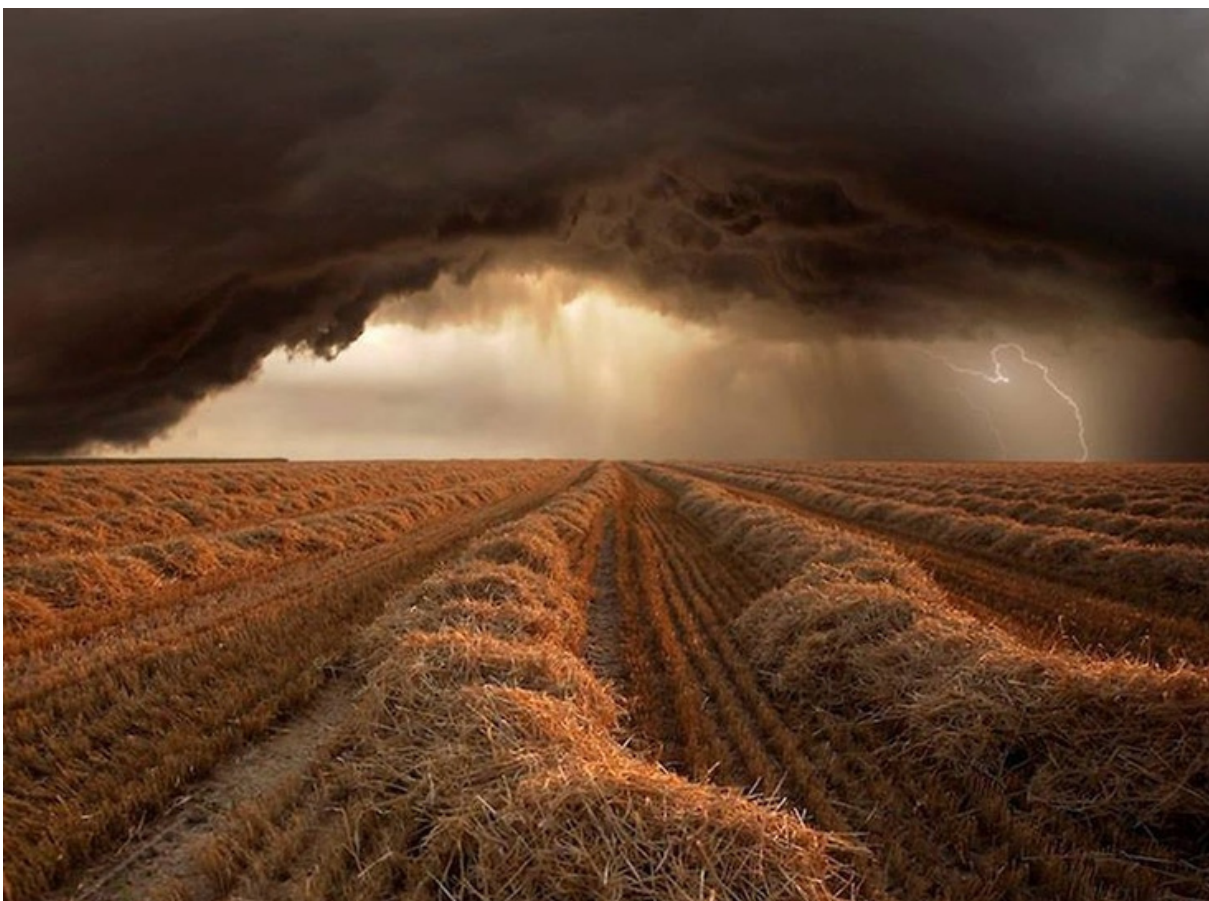
Kansas Summer Storm

We are sending our Chit-Chats out via email as well. Our emailed copies are in color and have many more features that our printed can't offer. If you'd like a copied emailed, send us a message on Facebook or an email at udallcty@cityofudall.com