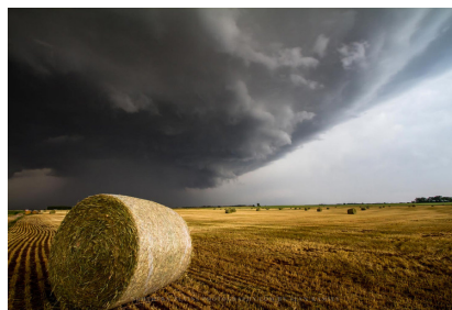
Round Hay Bale in Field Under Storm in Kansas Southern Plains Photography